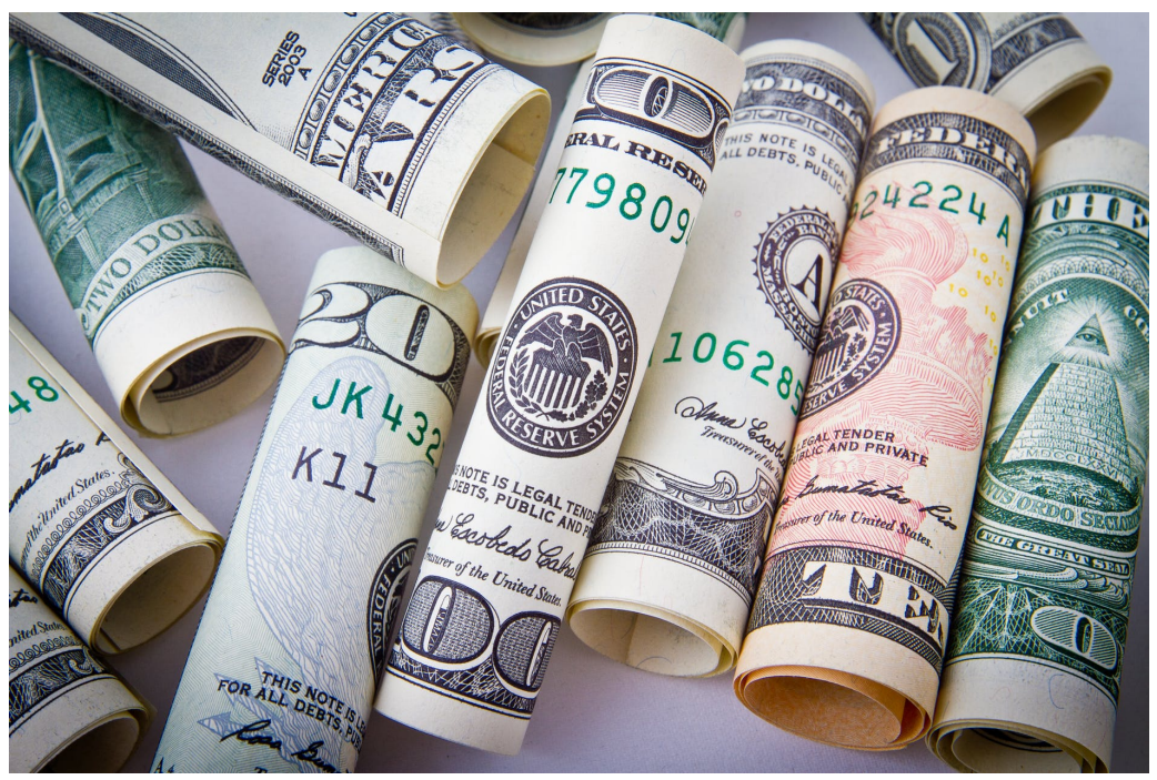
Paper notes Currencies, Capitals and Facts of ALL Countries of The World

Here, you will find all Capitals and Currencies of Central Asian Countries (CARs). These states are located in the North East of Pakistan and used to be parts of the Former Russian government known Union of Soviet Socialist Republics (USSR). These Central Asian states got independence after the collapse of the USSR back in 1991. Their current currencies and capitals are given as under